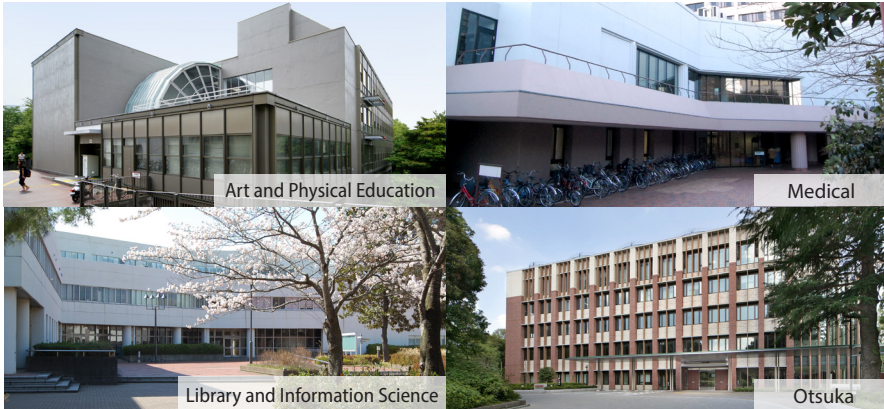
Art and Physical Education

The Central Library and four special libraries are available to anyone regardless of affiliation. They are places for cross-disciplinary communication.