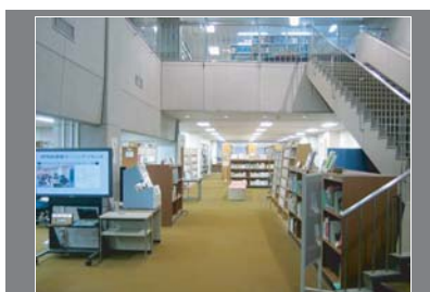
Library on Library and Information Science (029)859-1232