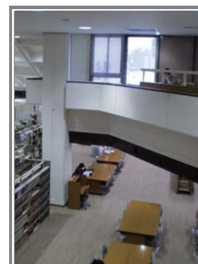
Medical Library (029)853-3256