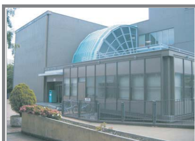
Art and Physical Education Library (029)853-2878