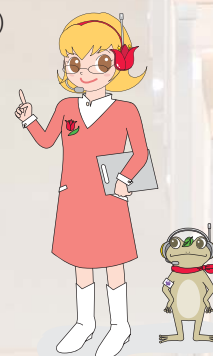
Official mascots of the Library Tulip-san & Gama-jumper