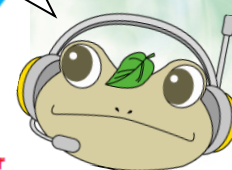
Library Mascot Gama Jumper