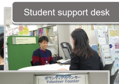
Student support desk