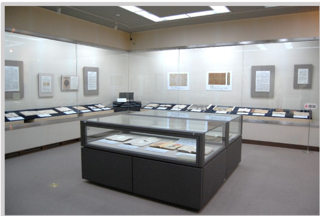
Must-see treasures in exhibit room (Weekdays 9:00-12:15, 13:15-17:00)

To protect the originals, access is usually restricted. Some of the collection has been digitized and can be viewed at the library's website.