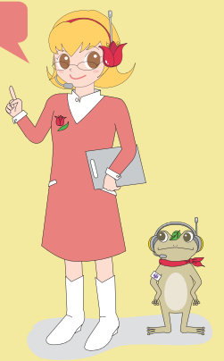
Official mascots of the Library Tulip-san & Gama-jumper