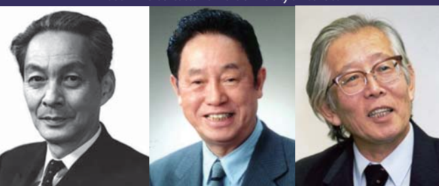
Dr. Sin-Itiro Tomonaga Former President 1965 Physics (Tokyo University of Education) Dr. Leo Esaki Former President 1973 Physics Dr. Hideki Shirakawa Professor Emeritus 2000 Chemistry