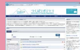
Tsukuba Repository (Tulips-R) https://tsukuba.repo.nii.ac.jp

Three Nobel Prize laureates have been associated with the University of Tsukuba. Besides, the University has actively developed new cross-disciplinary approaches to research like an interdisciplinary academic field called 'Cybernetics': the fusion of science and technology and medicine, HAL ® (Hybrid Assistive Limb) has been created with this technology. Such interdisciplinary research activities which are the strengths of the University of Tsukuba are supported by the enormous volume of materials and latest academic information base provided by the library.